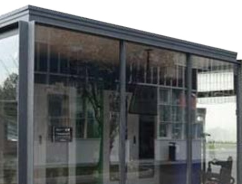
Project Cheap-GSHPs: Prototype of Heat Pump at the Technical Museum Nikola Tesla – Zagreb (Croatia)