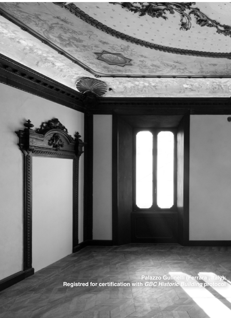
Palazzo Guinelli (Ferrara, Italy): Registered for certification with GBC Historic Building protocol

With its interdisciplinary approach, the workshop targets geologists, engineers, architects, energy managers and practitioners in modern and historical heritage, green building and construction chain-industry professionals along with buildings and cities managers, including UNESCO designated sites. These professionals and practitioners are asked to display new capacities and knowledge on how to master energy-environmental issues in the age of climatic change and emissions energy targets.